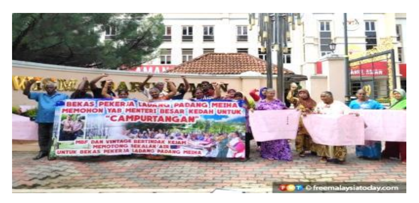
Padang Meiha ex-workers in front of Kedah MB's Office on 2/10/2020

Since 25th September 2019, more than 70 families of plantation workers from Padang Meiha estate located near Padang Serai in Kedah have been denied piped water supply. It is shocking that in the 21st century, developers can still resort to denying people basic needs such as water in order to forcefully evict them. The water vlqque was disconnected through action by MBf Holdings and subsidiary, Vintage its Developers Sdn Bhd.