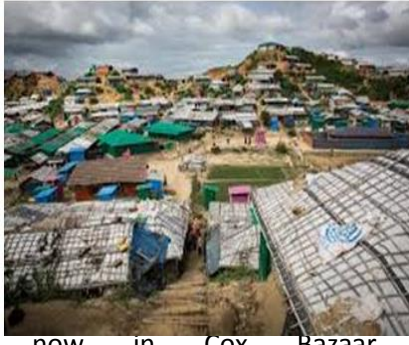
now in Cox Bazaar, Bangaldesh.

While several other ethnic minorities in Myanmar also have serious problems with the Myanmar state, the Rohingva are in the worst possible situation as Myanmar does not consider them citizens but claims that they are immigrants from Bangladesh. Bangladesh, meanwhile, denies that they are or were Bangladeshi citizens.